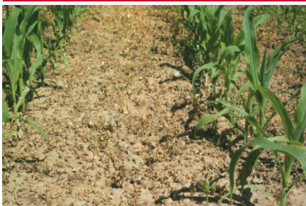
Armezon + atrazine + glyphosate