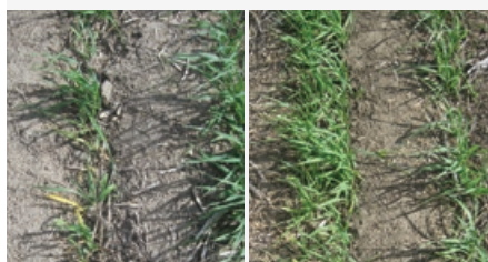
Cruiser® Vibrance® Quattro seed treatment