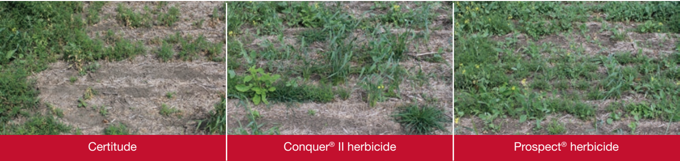
Source: BASF Small Plot Trials, Regina, Saskatchewan, 2022; canola and kochia control with medium droplets, 14 to 21 Days After Treatment